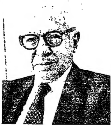
Prof. ISIDOR RABI — An American physicist of world renown, Prof. Rabi received the Nobel Prize in 1944, for developing atomic beam resonance methods. He has been a key figure in the birth of the atomic age, establishing a famous school at Columbia University in the 1930s. He was a prime mover in initiating the first international conference on the Peaceful Uses of Atomic Energy in Geneva, 1955.